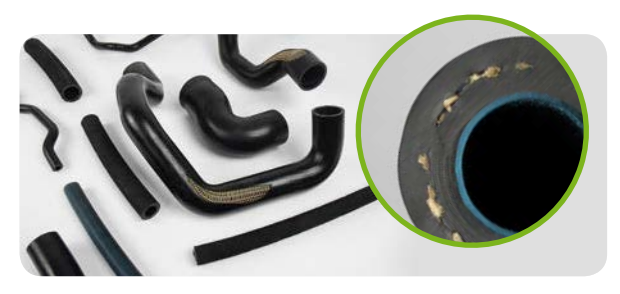
Hoses: Automotive and industrial hoses, cooling water hoses, air conditioning hoses, brake hoses, hydraulic hoses, industrial hoses, special hoses