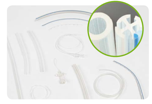
Medical applications: Catheter tubes, coextruded hoses, coextruded profiles, drainage tubes