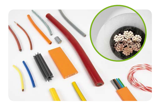
Cables: Single layer cables, multilayer cables